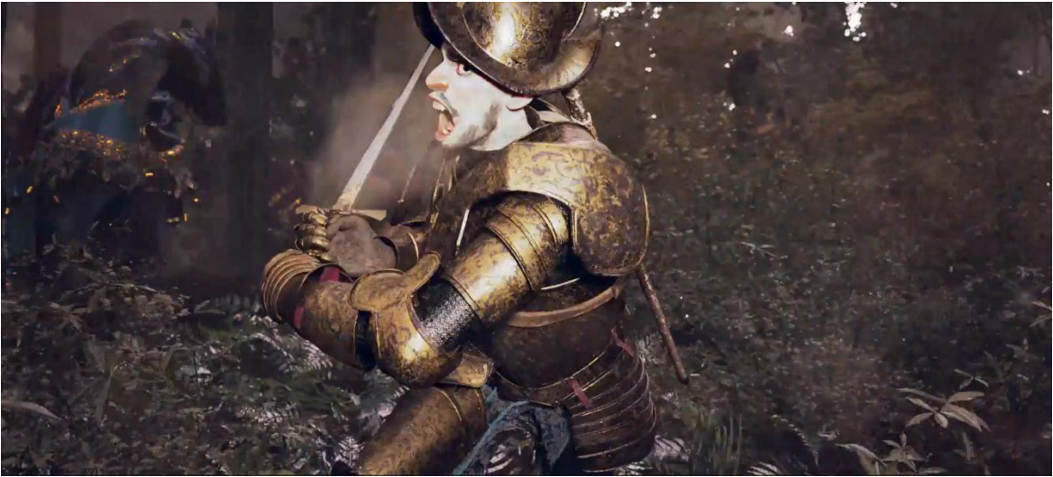
Figure. 1. Mielgo, A. (2022) Jibaro: Episode 9 of Season 3 Love, Death & Robots, Netflix.