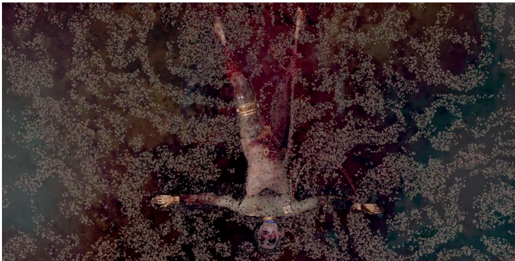
Figure. 5. Mielgo, A. (2022) Jibaro: Episode 9 of Season 3 Love, Death & Robots, Netflix.