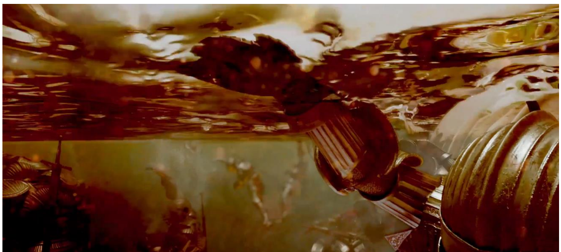
Figure. 3. Mielgo, A. (2022) Jibaro: Episode 9 of Season 3 Love, Death & Robots, Netflix.