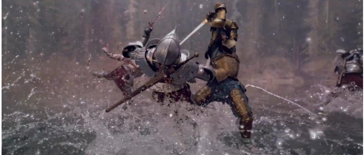
Figure. 2. Mielgo, A. (2022) Jibaro: Episode 9 of Season 3 Love, Death & Robots, Netflix.