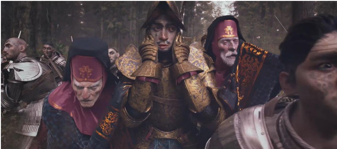
Figure. 8. Mielgo, A. (2022) Jibaro: Episode 9 of Season 3 Love, Death & Robots, Netflix.