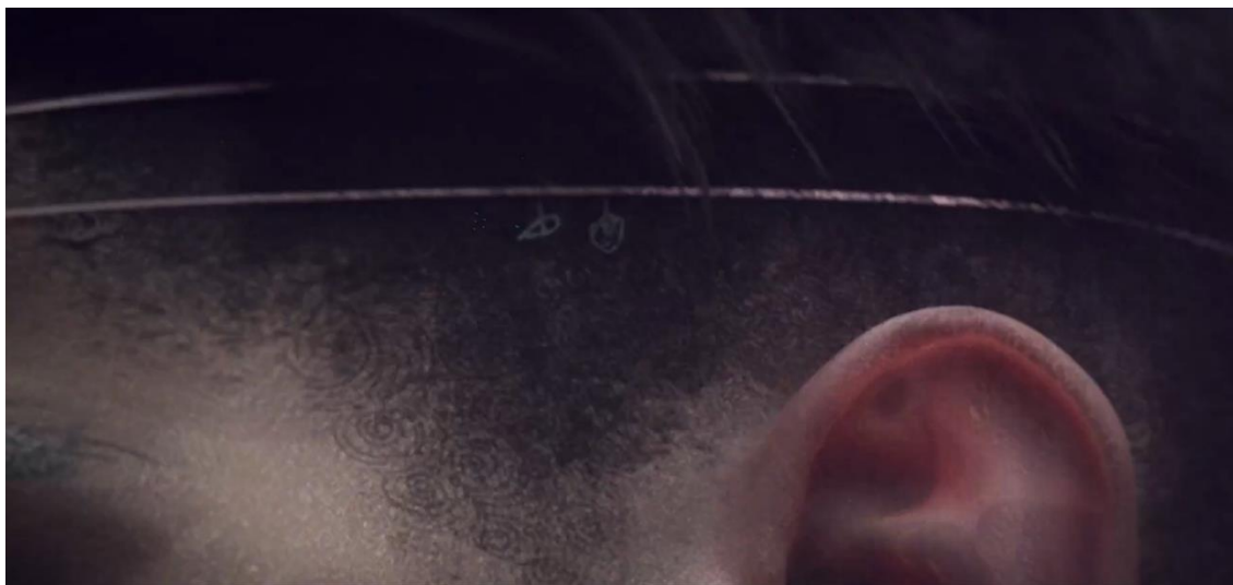
Figure. 9. Mielgo, A. (2022) Jibaro: Episode 9 of Season 3 Love, Death & Robots, Netflix.