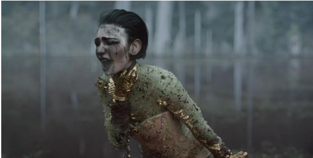
Figure. 4. Mielgo, A. (2022) Jibaro: Episode 9 of Season 3 Love, Death & Robots, Netflix.